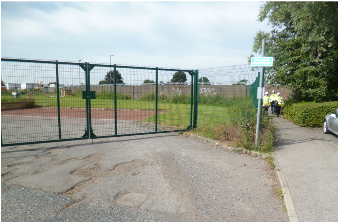
View from east to west along Allensway