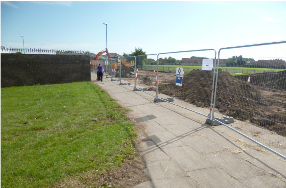
View from south to north from Tedder Avenue (proposed access connecting to Allensway)