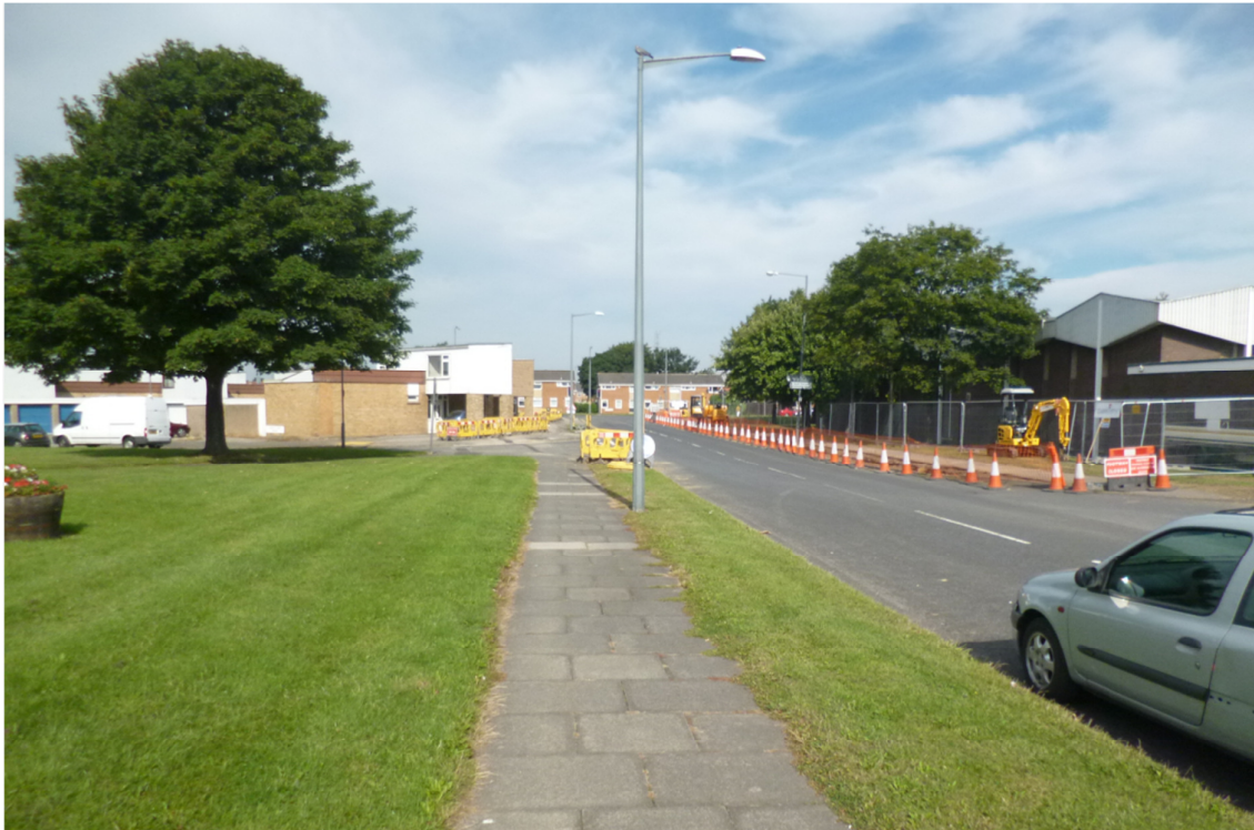
View west to east along Tedder Avenue