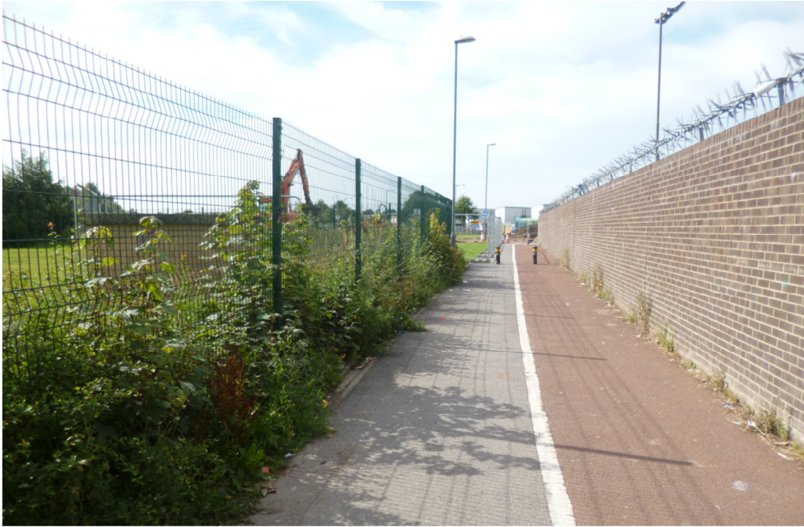
View north to south along existing footpath